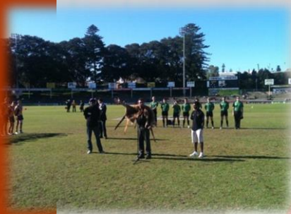
Tossing the coin at the South Fremantle v Claremont NAIDOC League WAFL match 2013