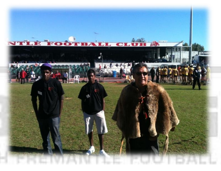
The nerves are rising