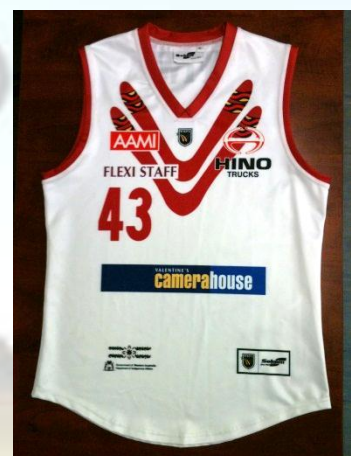
Wiluna's new representative jumpers: SFFC's 2012 NAIDOC Guernseys